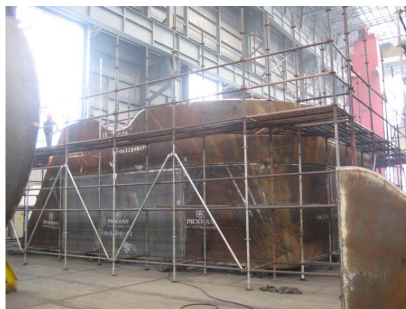
Huisman, building transition part crane base

The overall Vessel construction capex remains within the Company approved / revised budgets as earlier communicated to the market.