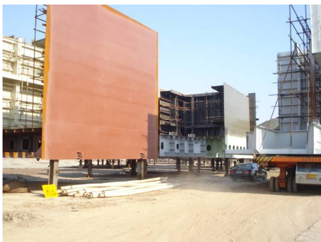
Section building and coating at Nantong Yahua Shipyard

Sembawang Shipyard is progressing with the detailed construction and outfitting engineering which is approximately 60% complete. The overall progress at the end of 2008 was lagging about 10% behind compared to planned. This is mainly due to construction work of the hull at Nantong Yahua Shipyard, China which is now lagging approximately 4-5 months behind schedule. Nevertheless, the keel-laying of the Vessel took place in November 2008. The Company assesses that it is unlikely that Sembawang will be able to fully recover the schedule to the contractual delivery date. On this basis the Company is currently taking into account a revised estimated delivery date of end 2 nd Quarter 2010.