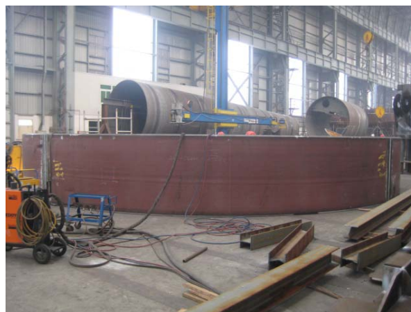
Huisman China, pedestal section foundation for lower slew bearing

In parallel, as to the 5,000 tonne Huisman crane, the engineering, procurement and steel cutting is progressing satisfactory and is currently according to schedule.