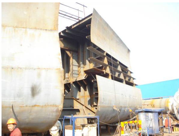
Bow section construction at Nantong Yahua Shipyard

Sembawang Shipyard is progressing with the detailed construction and outfitting engineering which is approximately 60% complete. The overall progress at the end of 2008 was lagging about 10% behind compared to planned. This is mainly due to construction work of the hull at Nantong Yahua Shipyard, China which is now lagging approximately 4-5 months behind schedule. Nevertheless, the keel-laying of the Vessel took place in November 2008. The Company assesses that it is unlikely that Sembawang will be able to fully recover the schedule to the contractual delivery date. On this basis the Company is currently taking into account a revised estimated delivery date of end 2 nd Quarter 2010.